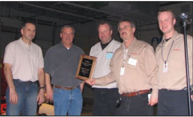
Morris Sales and Service, Virden, MB (2005 Sales Winner).