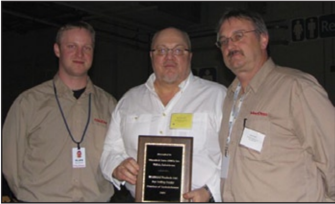
Wheatbelt Sales, Wadena, SK (2005 Sales Winner).