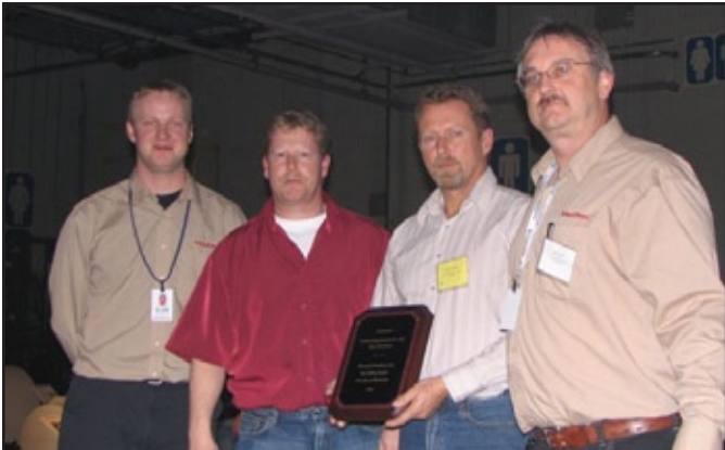
Chabot Implements, Elie, MB (2006 Sales Winner).