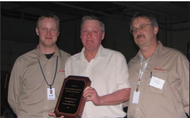
Miller's Farm Equipment, Moosomin, SK (2006 Sales Winner).