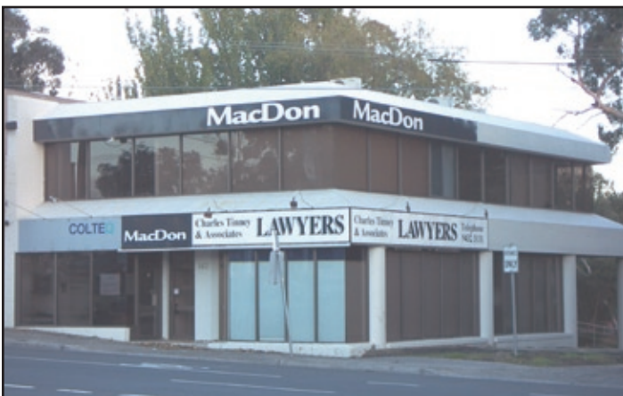
New office exterior viewed from Main Street.

Renovations were made to the reception and meeting areas in the new building; we tried to keep a rural type theme with post and wire at the top of the stairs and corrugated iron and wood on the reception desk. With more space at the new office, we are planning to run some training sessions for dealers in the future. We are all very happy in our new home and we think you will agree that it is a great facility.